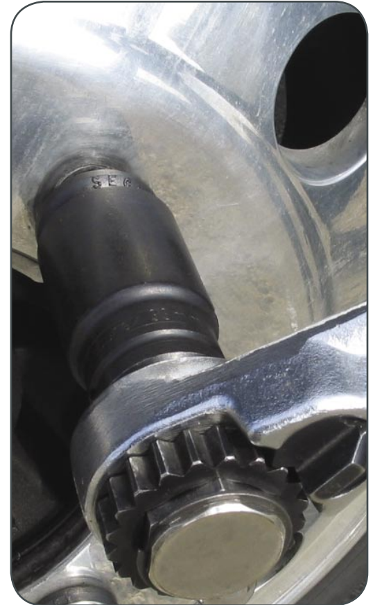
Torque wrench installation